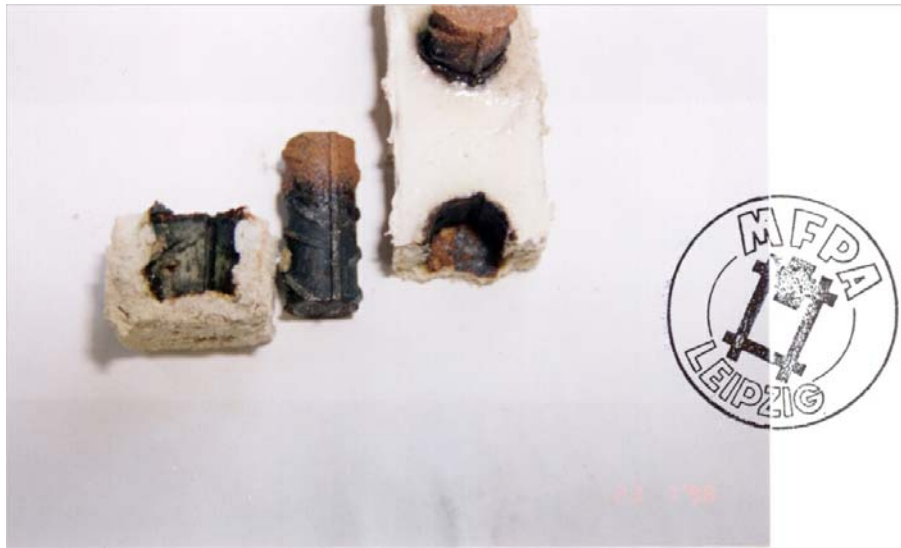
From an investigation report of the MFGA-Leipzig : The dark parts of the steel are protected by the contact with HydroBloc® Injekt 583. Storage under water, without traces of rust.

HydroBloc® Injekt 583: Unique Injection resin with active corrosion protection