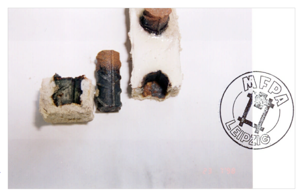
HydroBloc-Injekt 583: Unique Injection resin with active corrosion protector

Aus einem Untersuchungsbericht der MFPA-Leipzig: The dark parts of the steel are protected by the contact with Injekt 583. Storage under water, without treces of rust.