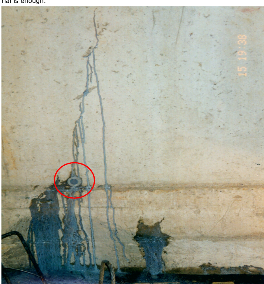
Important in praxis Excellent penetration and excellent running properties even on long ways

For cleaning of tools and machines water with some household dish washing material is enough.