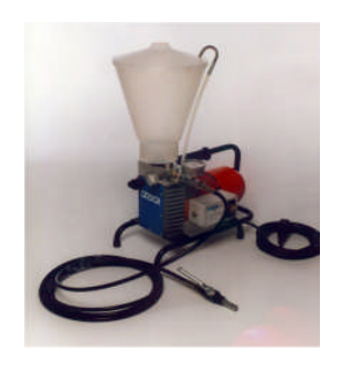
HydroBloc-Injekt 583: Simple application with common machines